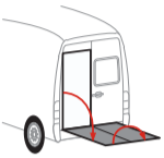
Bär VanLift FreeAccess (A2V)

Fitment without modification of the vehicle body. Fitment to front, rear and 4x4 drive possible.