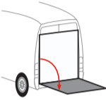
Bär VanLift Standard (S2V)