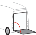
Bär VanLift Standard (S2V)